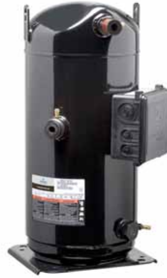
ZP Scroll Compressor

ZP104, ZP122 and ZP143KCE compressors for light commercial systems have a reduced footprint and weight for more compact systems. Their high efficiency helps to reduce operating costs.